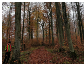
Photo: Dehesa de Valsalobre marteloscope

Recently, Spanish members of the Integrate Network, including the managers of the "Dehesa de Valsalobre" forest, had a meeting at the forest's marteloscope to explore the potential of the I+Trainer app by performing some simulation exercises. This was a great test of the latest version of the software (v.0.7.9.4 beta), which includes useful new features (e.g. the option to select a tree by introducing its numeric id) and translation to previously unavailable languages such as Spanish. A full step-by-step manual in Spanish on how to configure and use this version of the app was prepared. Learn more details here .