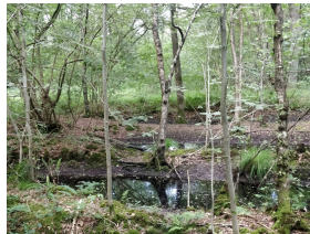
Photo: exploring marteloscope in Lazio, Italy

In Italy, marteloscopes are one of the most useful tools to communicate and teach how biodiversity conservation can be integrated into traditional forestry practices. In the past years, the Pennataro marteloscope in southern Italy, developed by the University of Molise, was used as an outdoor laboratory to implement teaching activities with students and forest practitioners. In the meantime, a team of forest researchers from the university set up a new marteloscope within the Riserva Naturale Regionale Selva del Lamone in Lazio in cooperation with the reserve staff. You can learn more about their ideas and methods to support sustainable forest management and the implementation of the Italian national forest strategy here .