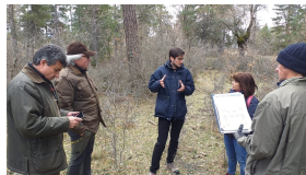
Photo: new marteloscope in Flanders